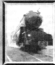
Train Of Tears